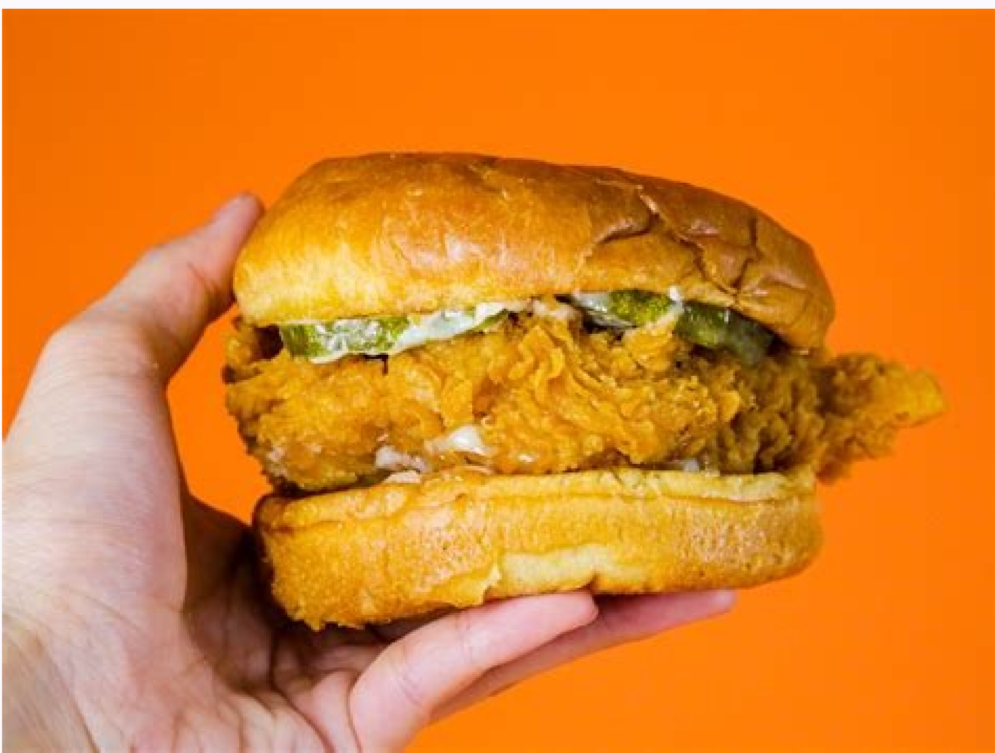
Popeyes classic chicken sandwich nutrition. Popeyes deluxe chicken sandwich nutrition.